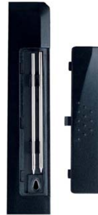
Two Replacement Ink Cartridges in the Cartridge Compartment